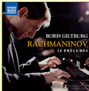
Rachmaninov: The Complete 24 Preludes for Piano Boris Giltburg (Naxos)