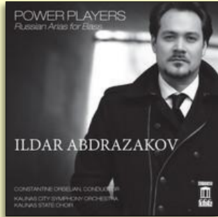
"Power Players," Russian Opera Arias Ildar Abdrazakov, bass Delos

Curiously, Ildar Abdrazakov (pronounced ahb-drah-ZHA-koff ) didn't start out singing the great basso roles in Russian opera. Early-on, his elegantly smooth bass-baritone voice made him more of a natural for the Franco-Italian repertoire in which he then specialized. Over the years, his voice has gradually deepened to the point where it carries the greatest authority. He displays it in the Russian repertoire he explores in "Power Players." At the same time, his voice retains the beautiful cantabile quality that first gained him fame and recognition.